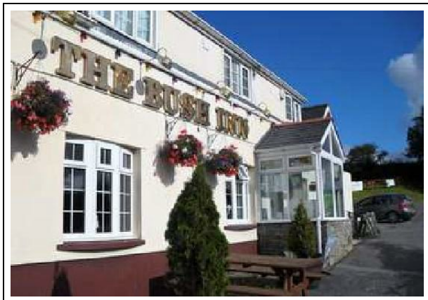
The Bush Inn at Robeston Wathen

The nights are drawing in and the weather is getting colder. Note the Saturday Venue change